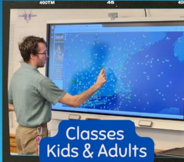
Classes Kids & Adults